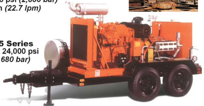
225 Series upto 24,000 psi (1,680 bar)