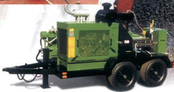
Model 40201D 40,000 psi (2,800 bar) 6 gpm (22.7 lpm)