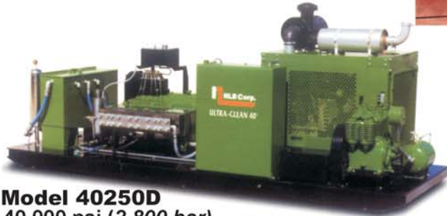
Model 40250D 40,000 psi (2,800 bar) 10 gpm (37.9 lpm)