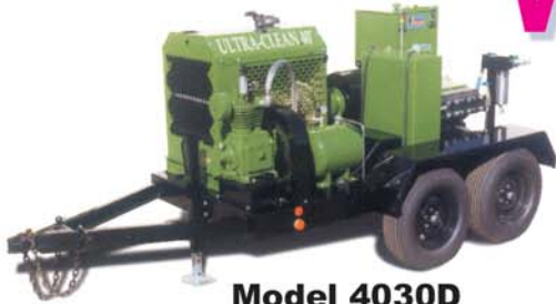
Model 4030D 40,000 psi (2,800 bar) 1.5 gpm (5.7 lpm)