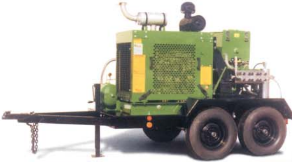
Model 4075D 40,000 psi (2,800 bar) 3 gpm (11.4 lpm)